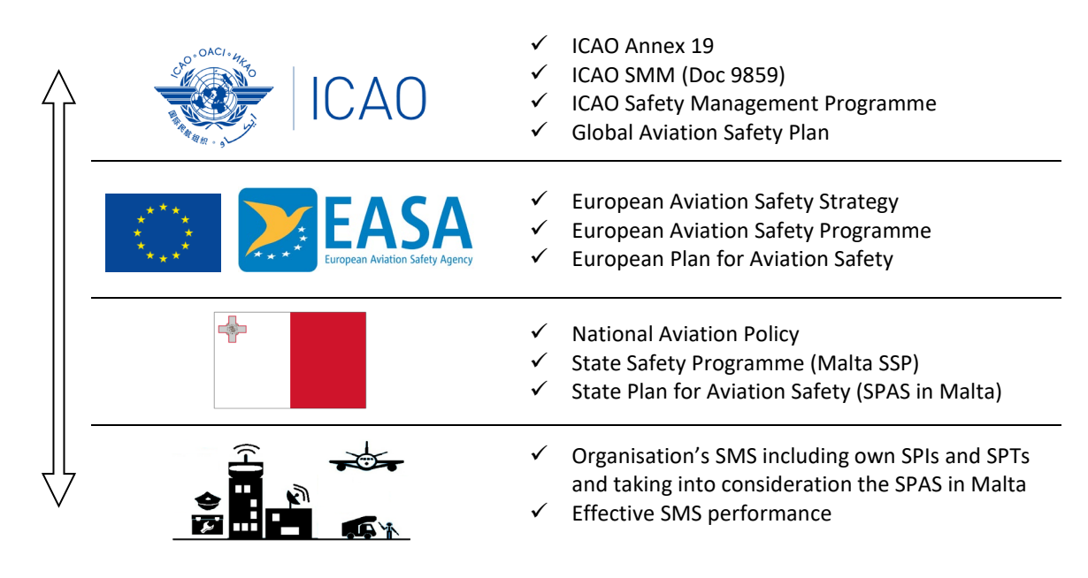
Figure 2 - Top-down and bottom-up approach of safety-management.

Aviation is a global business and hence requires States to work together and in a coordinated effort to ensure that safety is achieved across the different domains of the industry. In view of this, the major international and regional bodies provide various initiatives, documents and policies to help coordination at various levels.