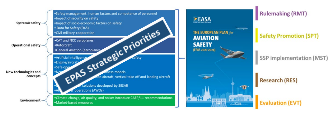
Figure 1 - Flow of EPAS Strategic Priorities Adapted from (EASA, 2020)

The EPAS actions assigned to the Member States are included in the State Plan for Aviation Safety in Malta. Aviation stakeholders must process, document, and implement the actions where applicable to their operation.