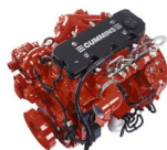
EURO 5 ENGINES