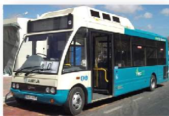
OPTARE HYBRID ECO BUS